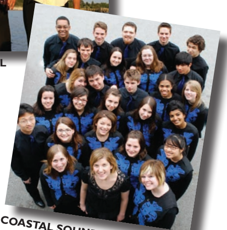
COASTAL SOUND YOUTH CHOIR

All proceeds go to support the Crossroads Hospice Society