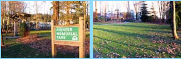
Pioneer Memorial Park, loco Road at Heritage Mountain, Port Moody, BC